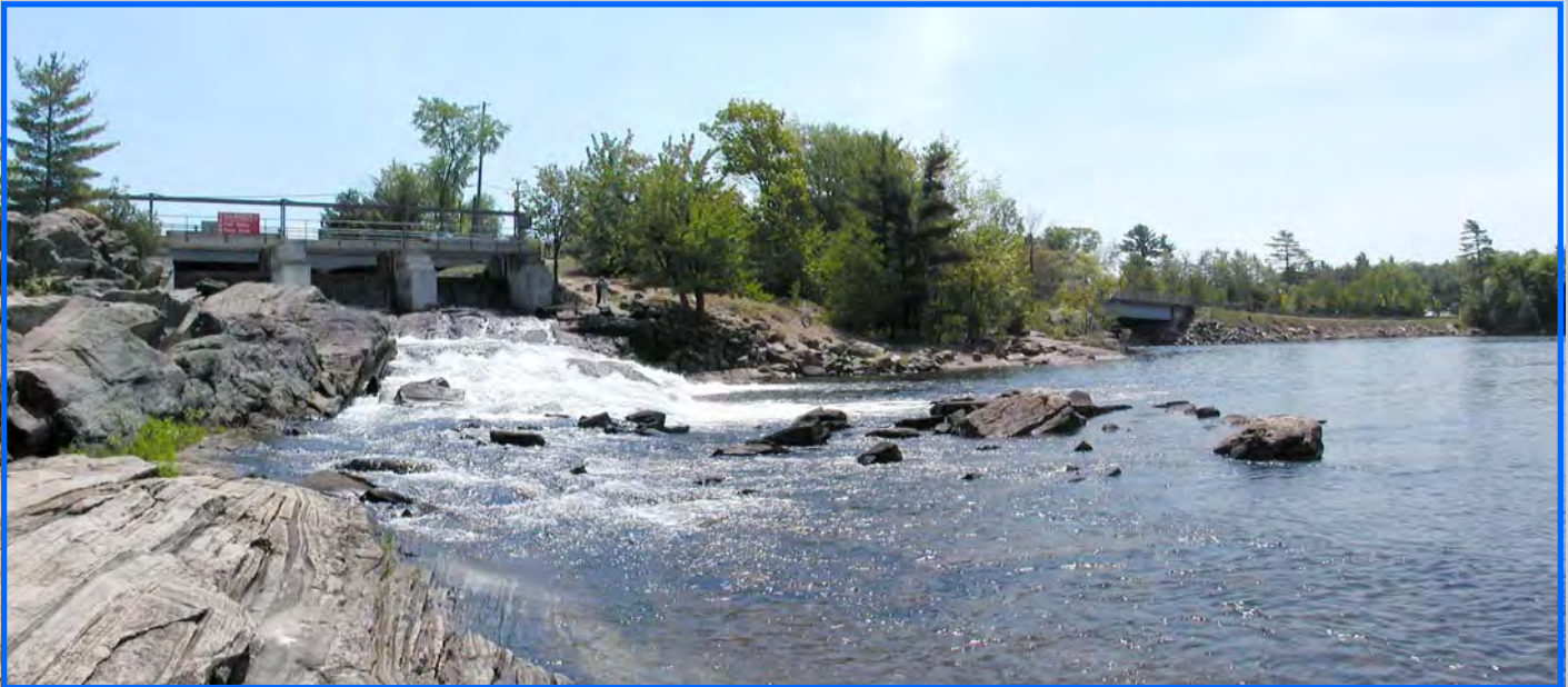
Above: Existing powerhouse area from Burgess Park Below: Proposed powerhouse from Burgess Park.