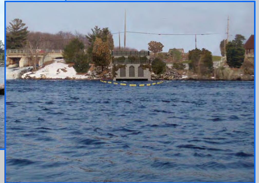
Photos clockwise from top-left: Existing intake area, Existing powerhouse area from Burgess Park, Existing powerhouse area from River/Cottages, Proposed powerhouse from river/cottages, Proposed powerhouse from Burgess Park, Proposed Intake.

Proposed landscaping and architecture represents a preliminary concept. Final landscaping and architecture will be developed with input from the Landscape Advisory Committee. Additional images and information are provided on the project website at www.balafalls.ca